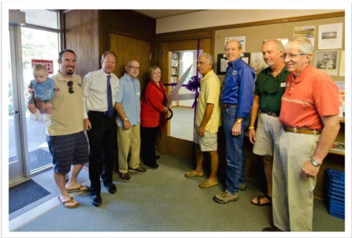
New Local History Door