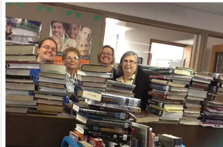
Checking in books