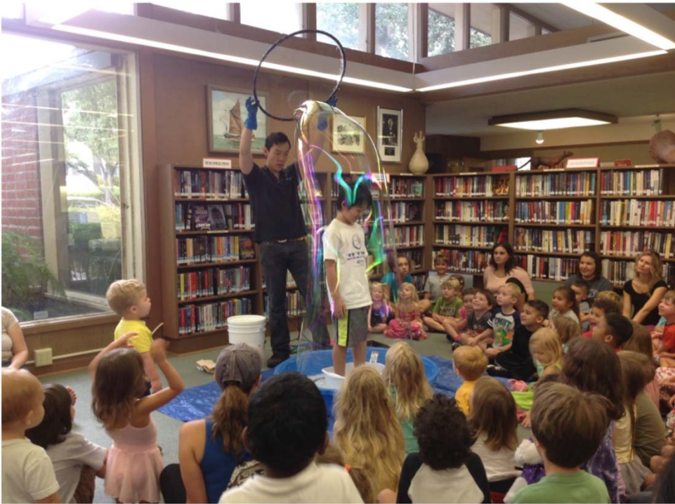
Bubblemania – 153 participants