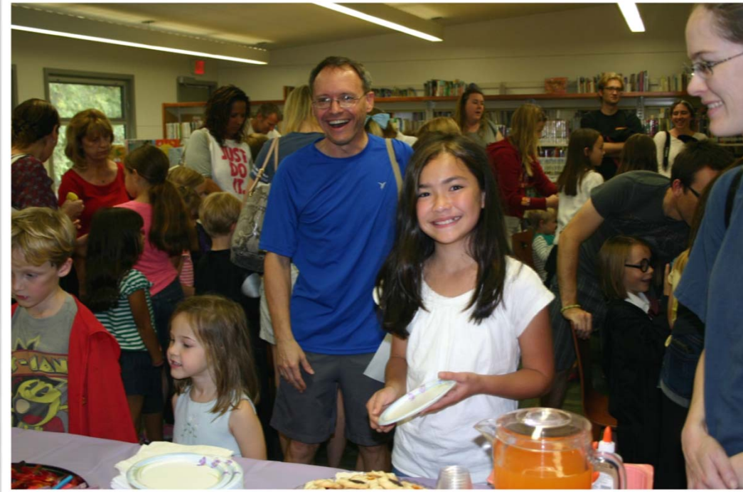
HARRY POTTER PARTY – 85 participants